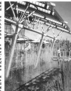
Landmark projects such as the M40 Wheatley service station demonstrate that sustainable development is now “absolutely central” to civil engineering.